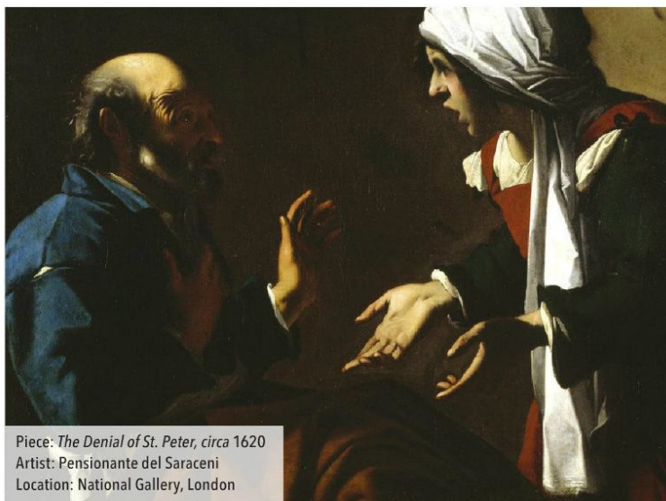
Piece: The Denial of St. Peter , circa 1620 Artist: Pensionante del Saraceni Location: National Gallery, London