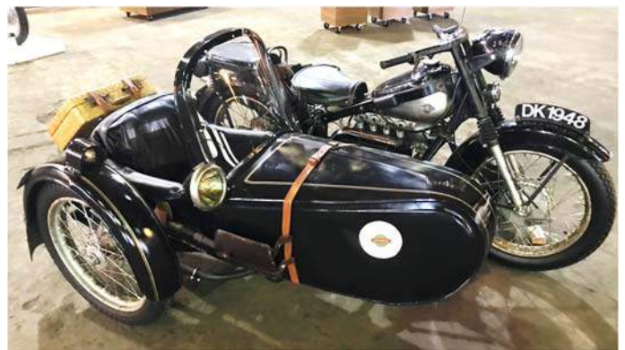
'Crash & Burn's' 1948 Nimbus Model C with sidecar