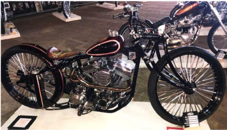
Aero Precision Metal Works "Dante's Inferno"