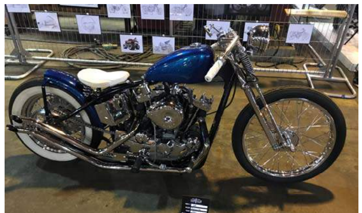
1980 Harley-Davidson Sportster Bobber