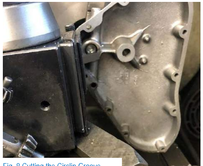
Fig. 8 Cutting the Circlip Groove