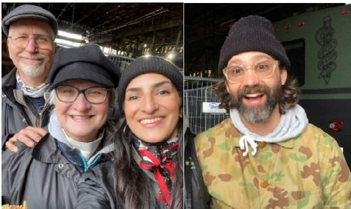
Some of the One Moto Show Check-In Crew