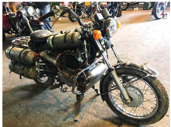
Cory Little's 1981 Honda Twin Star CM200T. Runs on compressed air.