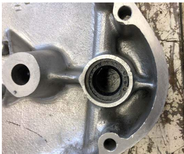
Fig. 3 Pre-Unit Timing Cover w/ Seal Upgrade