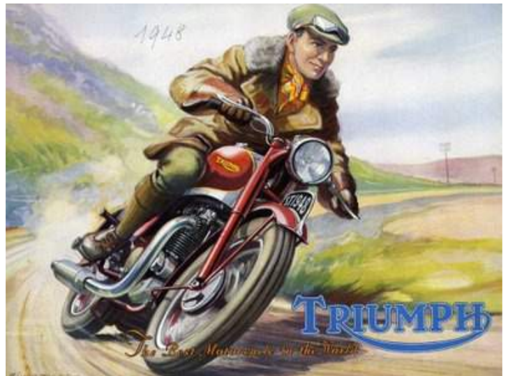
1948 Triumph Advertisement