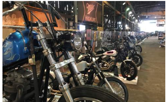
Line up at Zidell's