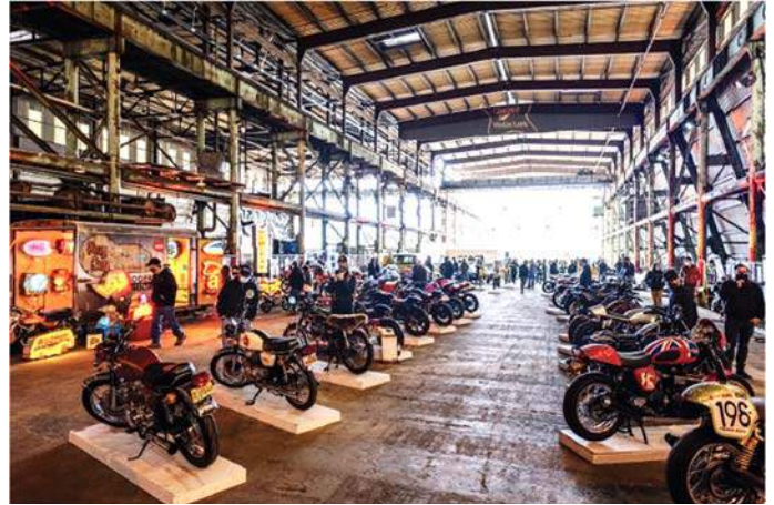
View Inside Zidell's Shipyard building