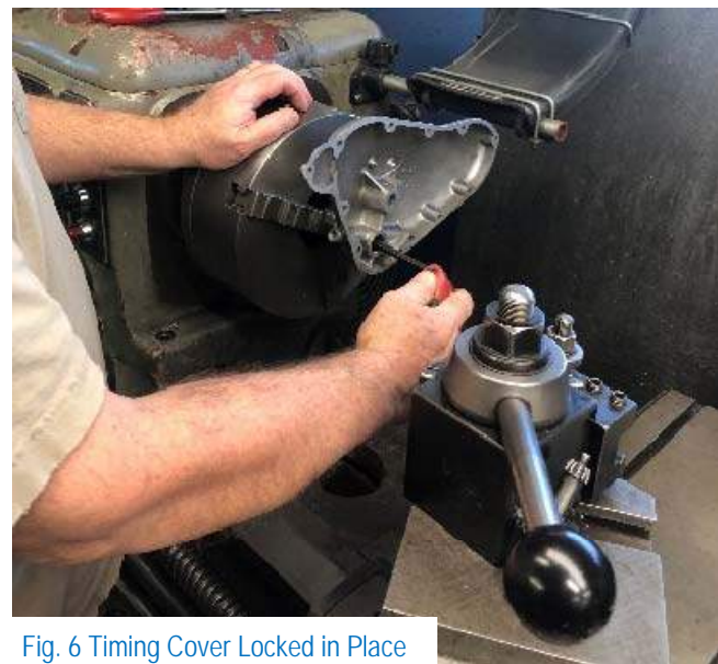
Fig. 6 Timing Cover Locked in Place