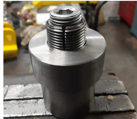
Fig. 4 Tool for Mounting Timing Cover