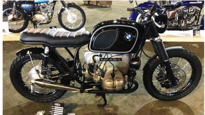
Sissy Moto's 1974 BMW R90/6