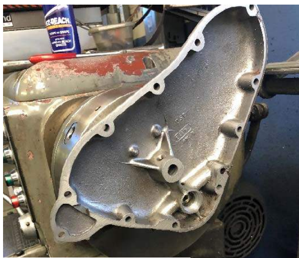
Fig. 9 Finished Product