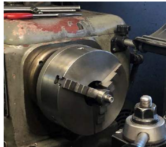
Fig. 5 Tool Placed in Lathe