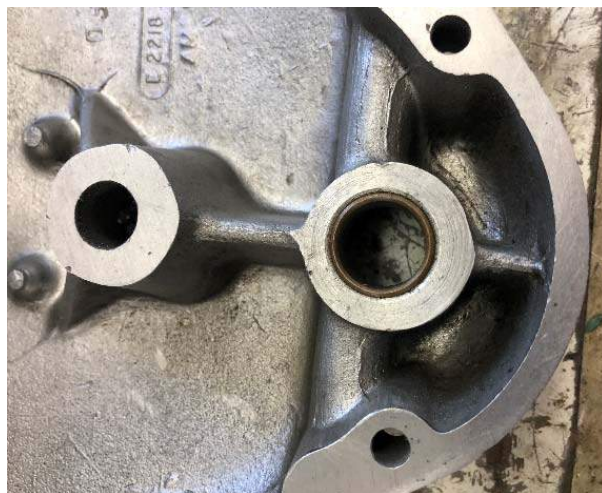
Fig. 2 Pre-Unit Timing Cover w/ Oil Bushing