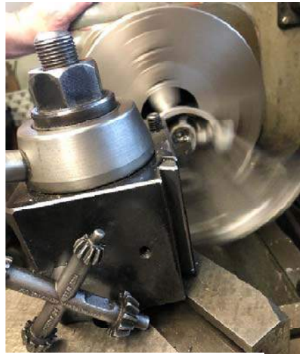
Fig. 7 Cutting the Counterbore

Larry can be reached at: (360) 513-2576 or eljaysmachine@comcast.net