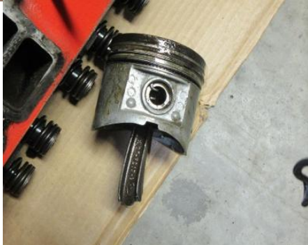
Note the twist