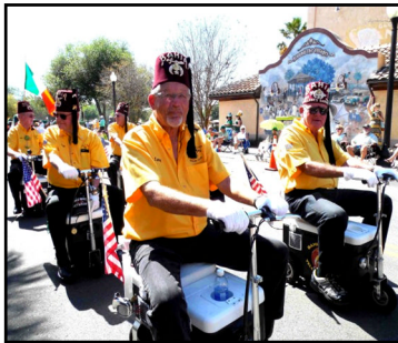
Yellow Jackets at St. Patrick's Day Parade March 17th

How time flies when you are having fun. The Cooler Guys enjoyed the day at the St. Patrick's Day Parade in the Villages on Tuesday, March 17 th .