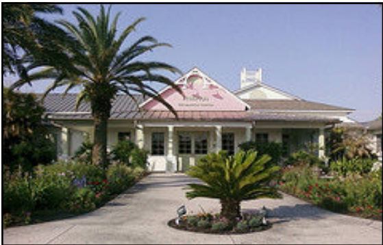
MEETING PLACE OF THE VILLAGES SHRINE CLUB Hibiscus Recreation Center 1740 Bailey Trail, The Villages, FL