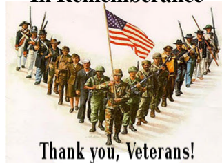
Thank you, Veterans!