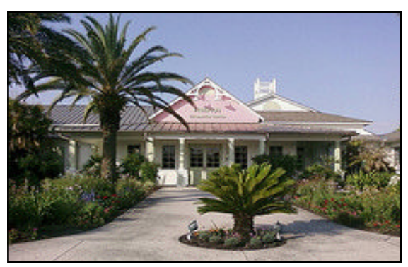
MEETING PLACE OF THE VILLAGES SHRINE CLUB Hibiscus Recreation Center 1740 Bailey Trail, The Villages, FL