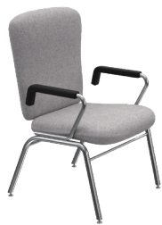
EC-H-4 A : 19 1/4 " C : 18" E : 20"