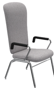
EC-E-4P A : 19 1/4 " C : 18" E : 28"