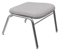
EC-O-4 A : 23 3/4 " C : 17 3/4 "