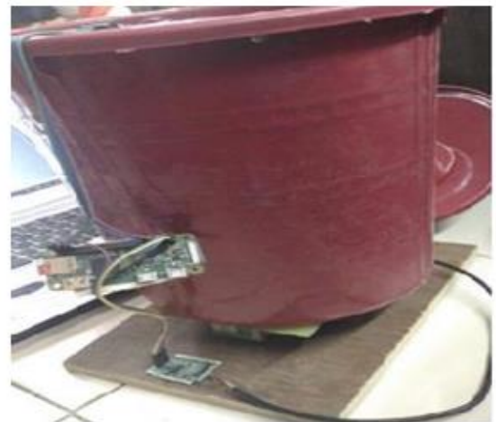
Figure 5: Container assemble with component

In this project we are using waste to produce gas for the kitchen use. With biogas generation method can generate the gas which is useful as the fuel wherever we can use normal LPG gas.