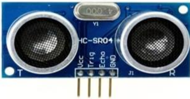
Figure 2: Ultrasonic Sensor

The Ultrasonic sensors here we use are to detect the level of the waste bin. There is three ultrasonic sensors will be placed at each angle of 120 degrees from each other so that the whole area of the waste bin can be covered. The waste bin has a protecting box at the top center where the ultrasonic sensors will be placed. According to the size of the waste bin the range of the Ultrasonic sensor will change. Considering all the parameters, including size, things on it, the specifications of the ultrasonic sensors can be implemented.