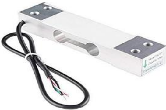
Figure 3: Load cell

The Load cells are placed at the 4 corners of the waste bin in the bottom. The load cell can be used as a secondary sensor. If there is any problem in the ultrasonic sensor, it will not send the output to the municipality. In this situation we can use this as a backup plan. The load cells are god for the keeping of the sensor which we can use it as the secondary storage.