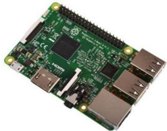
Figure 1: Raspberry-Pi

In this paper we use as the controller for the coordinator node. Raspberry Pi is the small, inexpensive minicomputer that enables people of all ages to explore computing, and to learn how to program in languages. It's job in this paper is it continuously collects the information's send by the sensor nodes via ZigBee, and it will process the large quantities of data timely and is available for users to view at the instant. It is the core of the whole system.