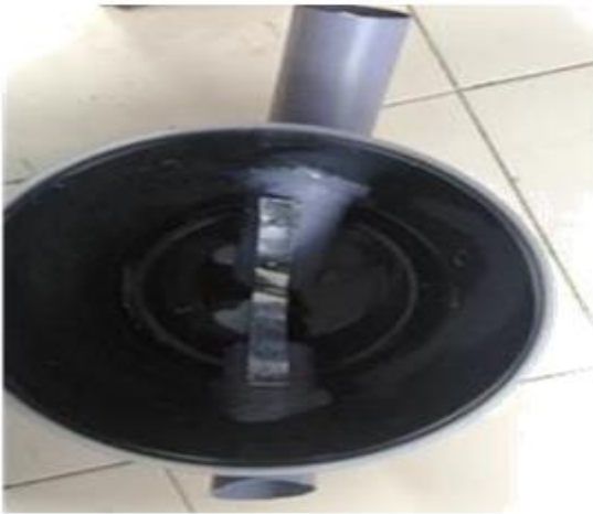
Figure 6: Biogas Container Inner Side.