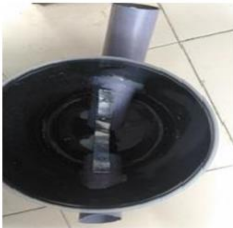
Figure 7: Biogas container