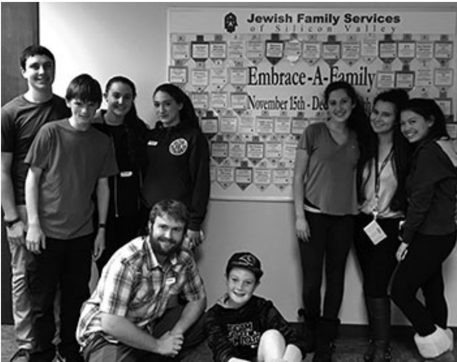
Temple Emanu-El's EESY youth group helped JFS get ready for Embrace-A-Family.