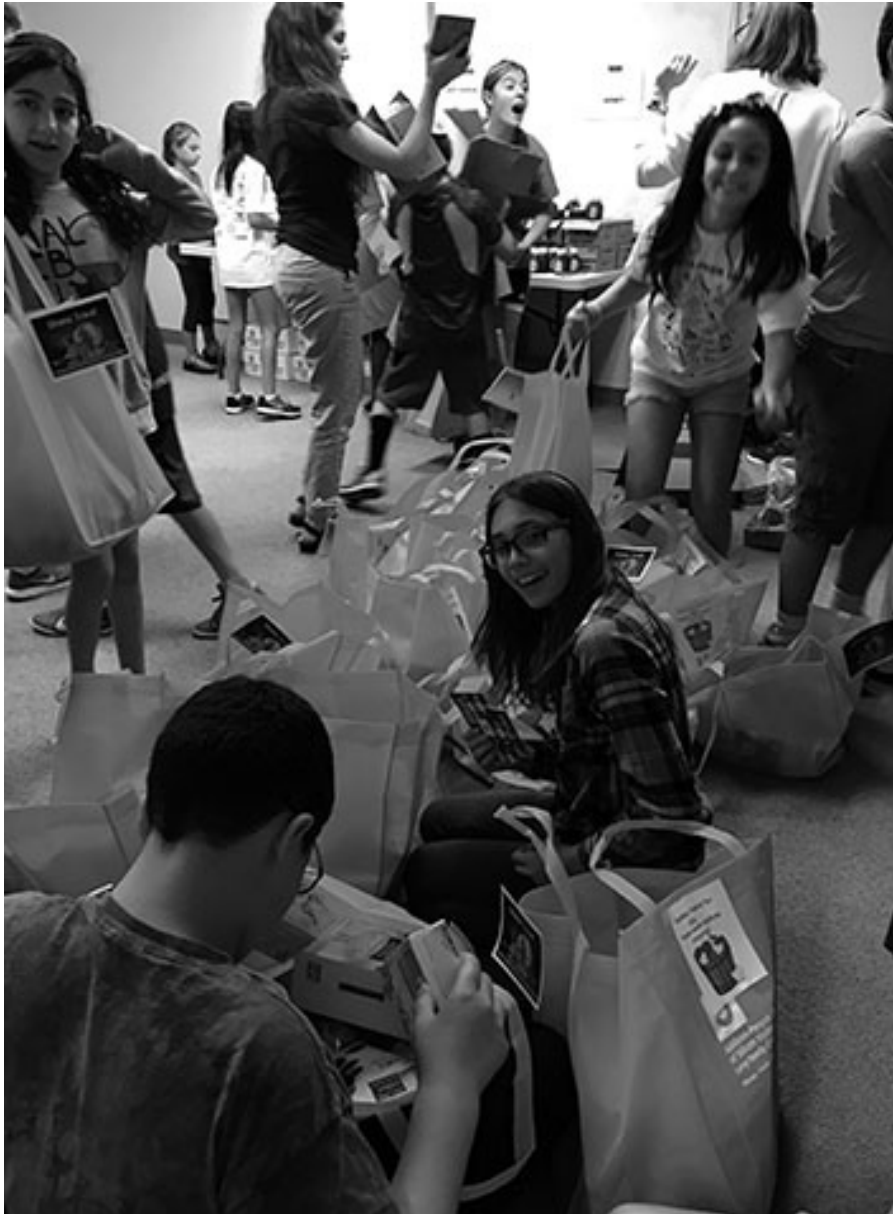
Yavneh 6th graders had a great time helping JFS pack nearly 600 food packages. We can't wait to have them join us again!

Donations August 11, 2017 - November 14, 2017