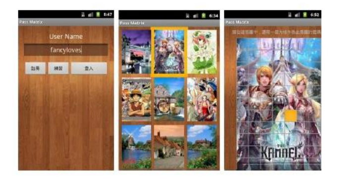
Fig. 11. (a) The Main page of PassMatrix, users can register an account, practice or start to log in for experiment. (b) Users can choose from a list of 24 images as their pass-images. (c) There are 7 \times 11 squares in each image, from which users choose one as the pass-square.

In this type of authentication multiple images can be provided to the user, the user has the select the image that he can to log in, this will the provide more security.