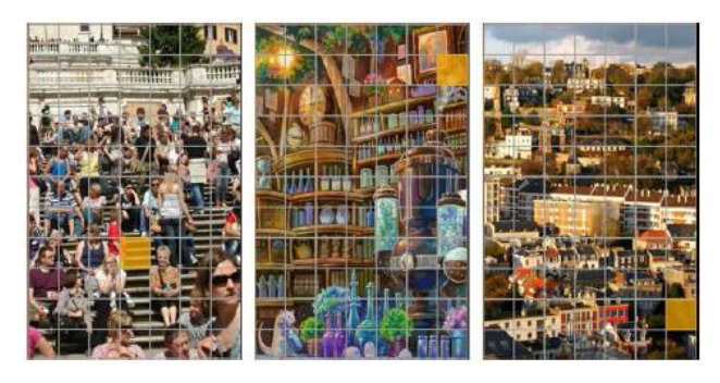
Fig. 5. A password contains three images (n=3) with a pass square in each. The pass squares are shown as the orange-filled area in each image.

To conquer (1) the security shortcoming of the customary PIN technique, (2) the ease of getting passwords by onlookers out in the open, and (3) the similarity issues to gadgets, we presented a graphical validation framework called Pass Matrix. In Pass Matrix, a mystery key contains only a solitary pass-square per pass-picture for a gathering of n pictures. The amount of pictures (i.e., n) is customer described. Figure 5 exhibits the proposed conspire, in which the main pass-square is situated at (4, 8) in the primary picture, the second pass-square is on the highest point of the smoke in the second picture at (7, 2), and the last pass-square is at (7, 10) in the third picture. In Pass Matrix, clients pick one square for each picture for an arrangement of n pictures instead of n squares in a single picture as that in the Pass Points [7] conspire. In light of the client investigation of Cued Click Points . CCP strategy completes a great job in helping clients recall and recollect their passwords. On the off chance that the client taps on an inaccurate locale inside the picture the login will be fizzled