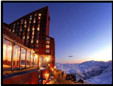
Hotel Puerto Del Sol