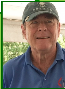
Closest to the Pin—2018

Cobra King F8 Irons With Cobra Connect $1,000 value