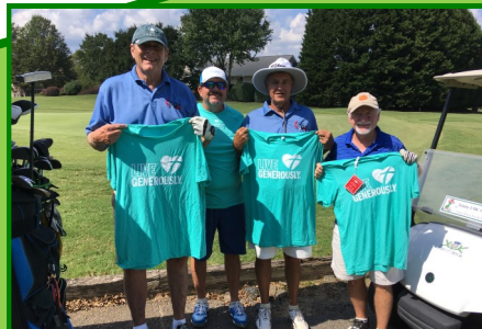
Trinity Methodist Church—2018 Church Winners

Links O' Tryon 11250 New Cut Road Campobello, SC 29322 864-468-5099 linksotryon.com