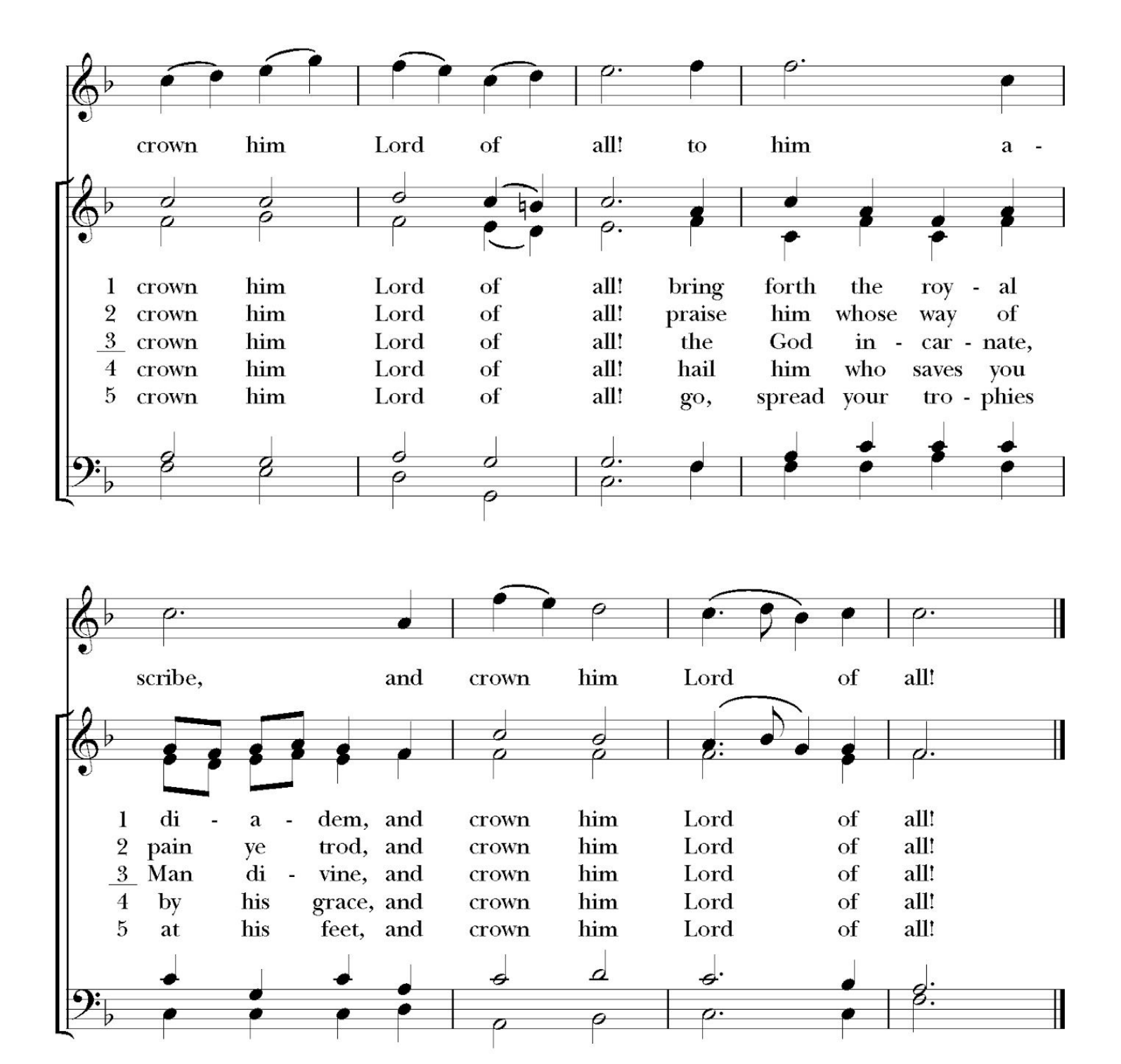
6 Let every kindred, every tribe, on this terrestrial ball, to him all majesty ascribe, and crown him Lord of all!