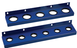
STOR-STRIP® MACHINE/WALL MOUNT CNC TOOL TRAY (4H x 27W x 5D) $125 (List price $250.00)