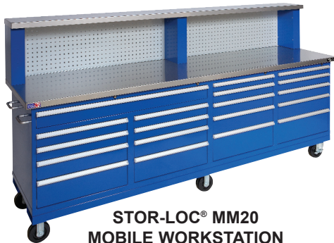
STOR-LOC® MM20 MOBILE WORKSTATION (43H x 120W x 30D) $8000 (List price $16,000.00)