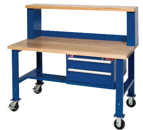
STOR-LOC® NU1 MOBILE WORKSTATION (38H x 60W x 30D) $1900 (List price $3,800.00)