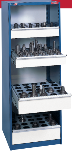
STOR-FRAME® CNC TOOL STORAGE (78H x 29¼W x 27¾D) $1900 (List price $3,800.00)