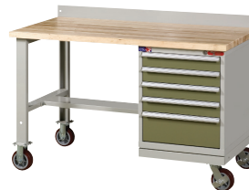
STOR-LOC® NU2 MOBILE WORKSTATION (38H x 60W x 30D) $2000 (List price $4,000.00)