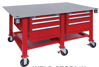
WELD-STOR® 4X (37H x 72W x 48D) $5000 (List price $10,000.00)