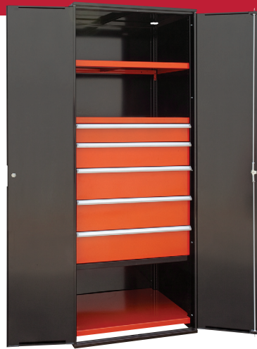
SW+ 1860-051 STOR-FRAME® WITH LOCKING DOORS (81H x 32W x 30D) $2300 (List price $4,600.00)