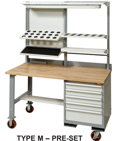
TYPE M - PRE-SET MOBILE WORKSTATION (38H x 60W x 27¾D) $3200 (List price $6,400.00)