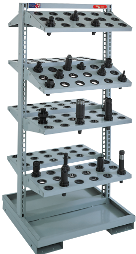
CNC TOOL RACK (62H x 29¼W x 27¾D) $1195 (List price $2,390.00)