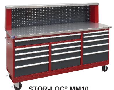
STOR-LOC® MM10 MOBILE TOOL STORAGE WORKSTATION (43H x 90W x 30D) $6000 (List price $12,000.00)