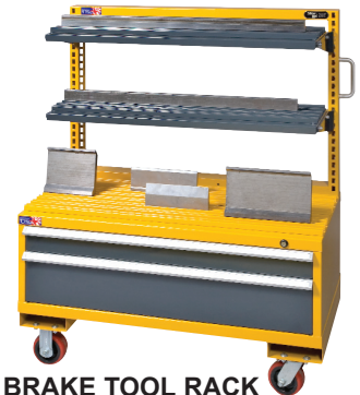
PRESS BRAKE TOOL RACK (62H x 46W x 25D) $2500 (List price $5,000.00)