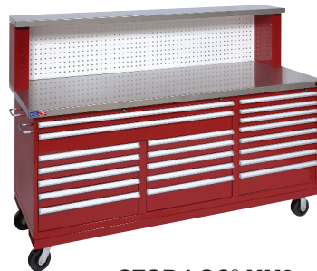
STOR-LOC® MM8 MOBILE TOOL STORAGE WORKSTATION (43H x 72W x 30D) $6000 (List price $12,000.00)