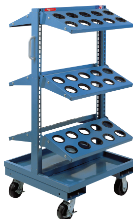
CNC TOOL CADDY (54H x 29¼W x 27¾D) $1195 (List price $2,390.00)