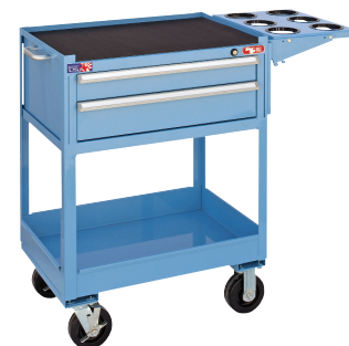
CNC STOR-CART® (42H x 29¼W x 21½D) $850 (List price $1,700.00)