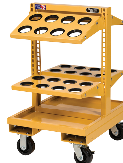
CNC MINI TOOL CADDY (38H x 23W x 27¾D) $795 (List price $1,590.00)