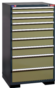
SW+® SERIES 1360-091 CABINET (59H x 32W x 27 3/4D) $2000 (List price $4,000.00)