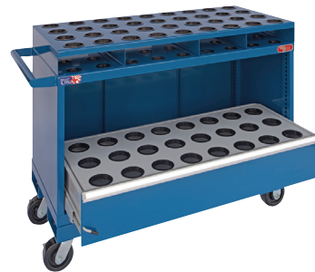
CNC TOOL CART PLUS (42H x 46½W x 22D) $2500 (List price $5,000.00)