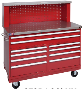
STOR-LOC® MM5 MOBILE TOOL STORAGE WORKSTATION (44H x 60W x 30D) $4000 (List price $8,000.00)