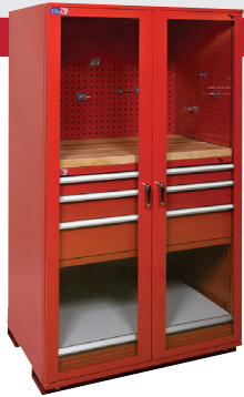
STOR-FRAME® VU-LOC® Three drawer storage with locking plexiglas doors and choice of Tool Board Kit (82H x 43 3/4W x 30D) $3000 (List price $6,000.00)