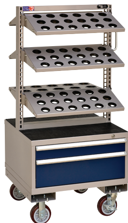
CNC STOR-CADDY® (54H x 29¼W x 27¾D) $1750 (List price $3,500.00)