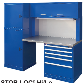
STOR-LOC® Hi/Lo WORKSTATION (78H x 90W x 30D) $5000 (List price $10,000.00)