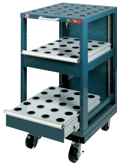
CNC TOOL CART (42H x 23W x 27¾D) $1100 (List price $2,200.00)