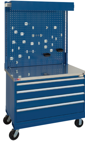
EW+ 600 MACHINE CENTER BENCH WITH STOR-TRAC™ (38H x 48W x 30D) $3500 (List price $7,000.00)