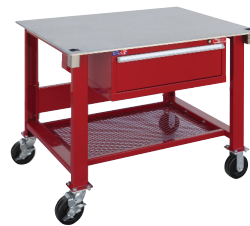
WELD-STOR® I (37H x 48W x 36D) $2000 (List price $4,000.00)