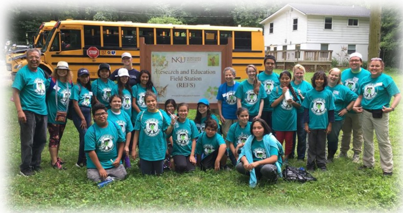
2018 Safari to the Water Underground