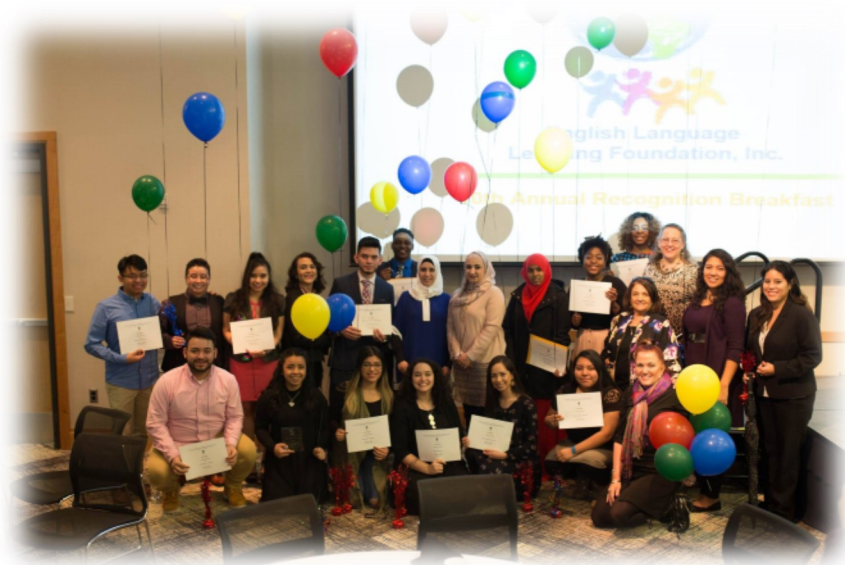
10th Annual Recognition Breakfast