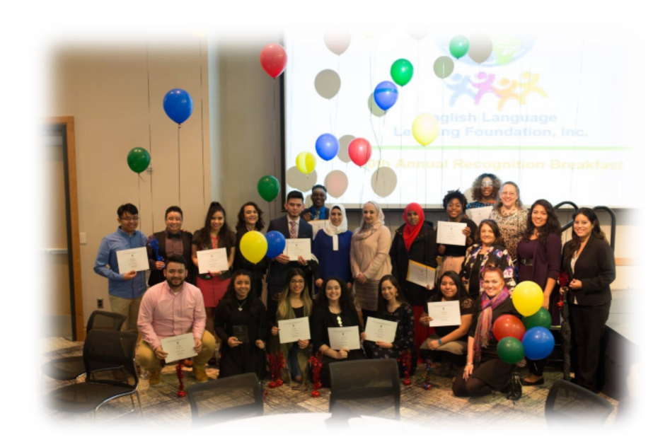
10th Annual Recognition Breakfast