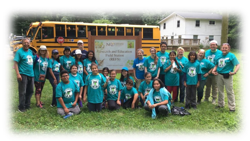
2018 Safari to the Water Underground