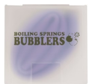
Bubbler Silicone Straw