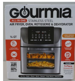
All-in-one air fryer, oven, rotisserie & dehydrator!