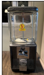
Antique Gumball Machine!