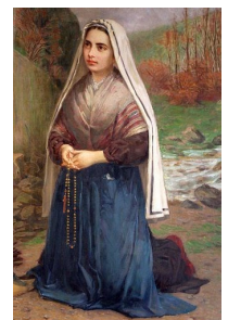
Feast Day: April 16