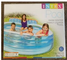
INTEX Family Pool!

Two 2024-25 season passes for all home sporting events!