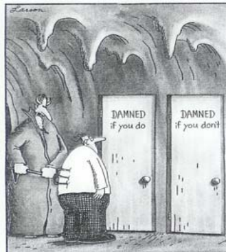
"C'mon, c'mon ....it's either one or the other."

Directions: Find the words that appear horizontally, vertically, or diagonally, and may be written forward or reverse.