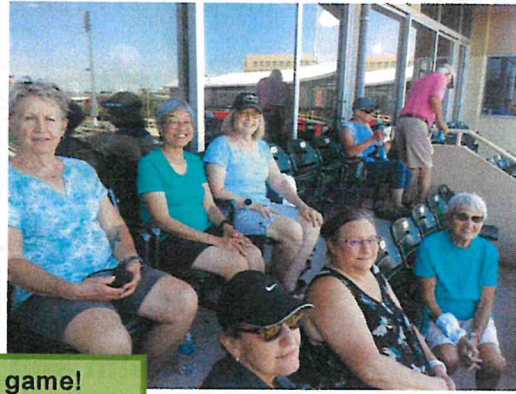
River Patrol Volunteers at the game!