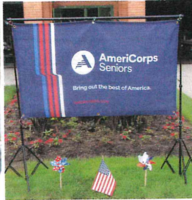
In Memory of these volunteers