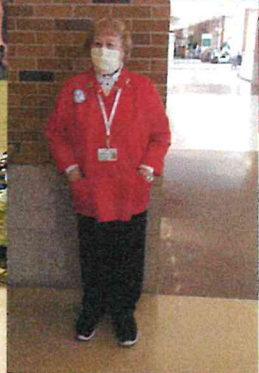
Some of our hard working volunteers, Foster Grandparents at Impression 5 Museums, knitters & crocheters, River Walk Patrol, Medical Driver, the May 2022 In-Service and Sparrow volunteer. Come join