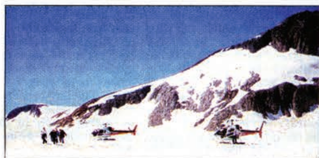
People travel by helicopter to Iditarod veteran Linwood Fiedler's camp on the Norris Glacier.

uninitiated, asking dogs to pull a sled may seem nothing short of cruel. But to huskies, even house pets like my own, pulling comes as naturally as breathing.