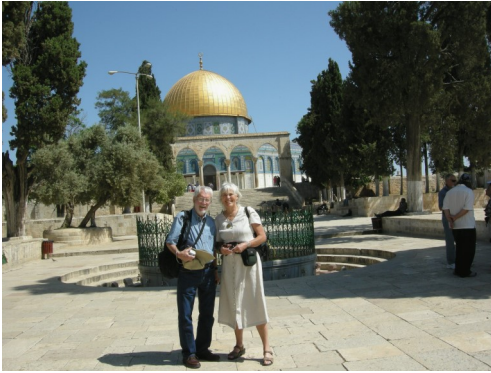
See the holy places - Jewish, Christian, Muslim.