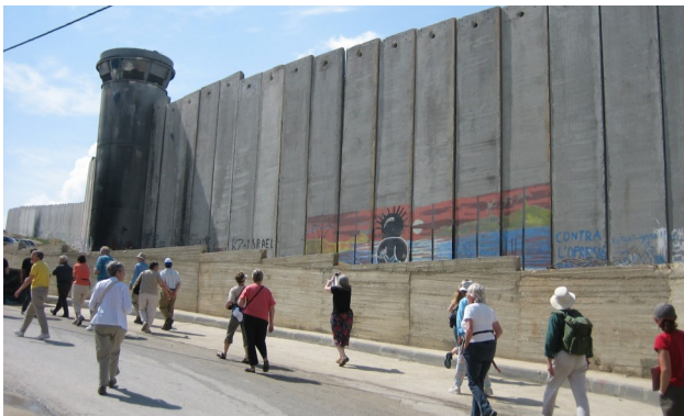
Learn about the impact of the Israeli occupation on Palestinian life and consider what is needed for a just peace.