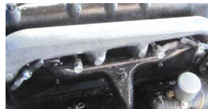
Exhaust manifold placed, outboard clamps turned and tightened to secure

Once the exhaust manifold is fitted and secured with the outboard manifold clamps, remove the two center "half-clamps" one at a time and replace them with the normal manifold clamps. This helps ensure both manifolds are held firmly in place during the installation and that the intake manifold gasket seal is maintained.