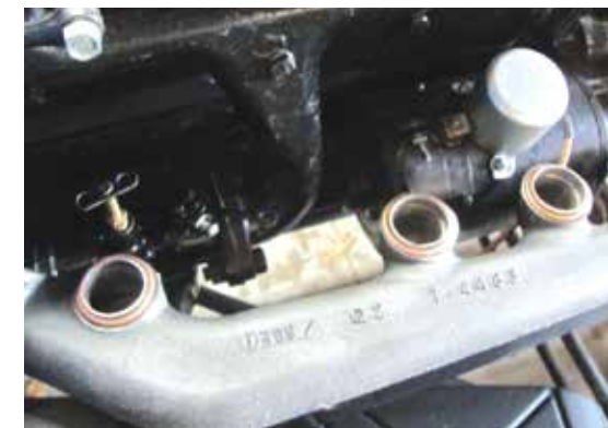
Gaskets fitted to exhaust manifold for install

Firmly tighten the half-clamps to crush the copper ring to seal the intake manifold, yet allow easy clearance to install the exhaust manifold. Use the regular clamp to lock the exhaust manifold in place.