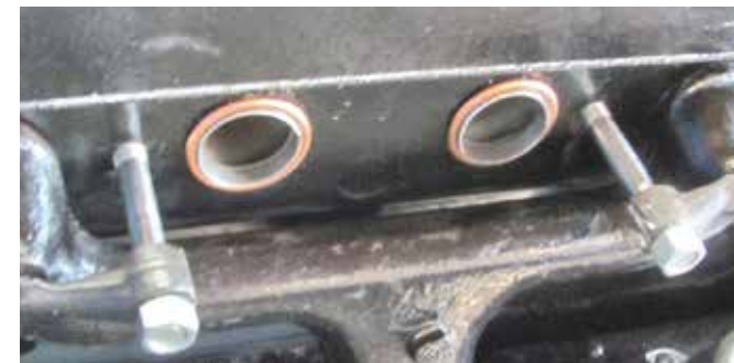
Tighten half-clamp, secure intake manifold

Firmly tighten the half-clamps to crush the copper ring to seal the intake manifold, yet allow easy clearance to install the exhaust manifold. Use the regular clamp to lock the exhaust manifold in place.