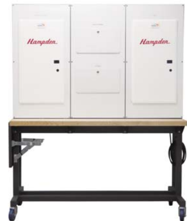
Model H-RCSD-4 Rear View