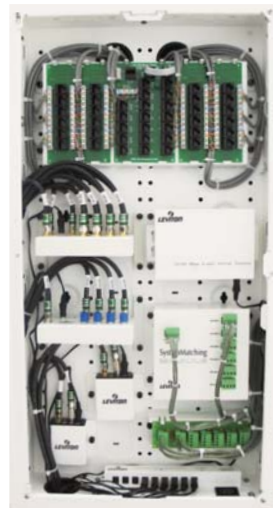
Model H-RCSD-4 Inside Front Panel

The Model H-RCSD-4 includes the following components: