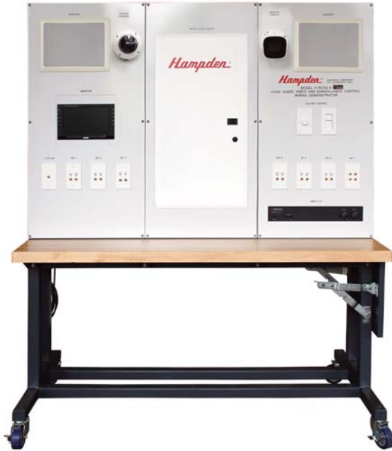
Model H-RCSD-4 Front View