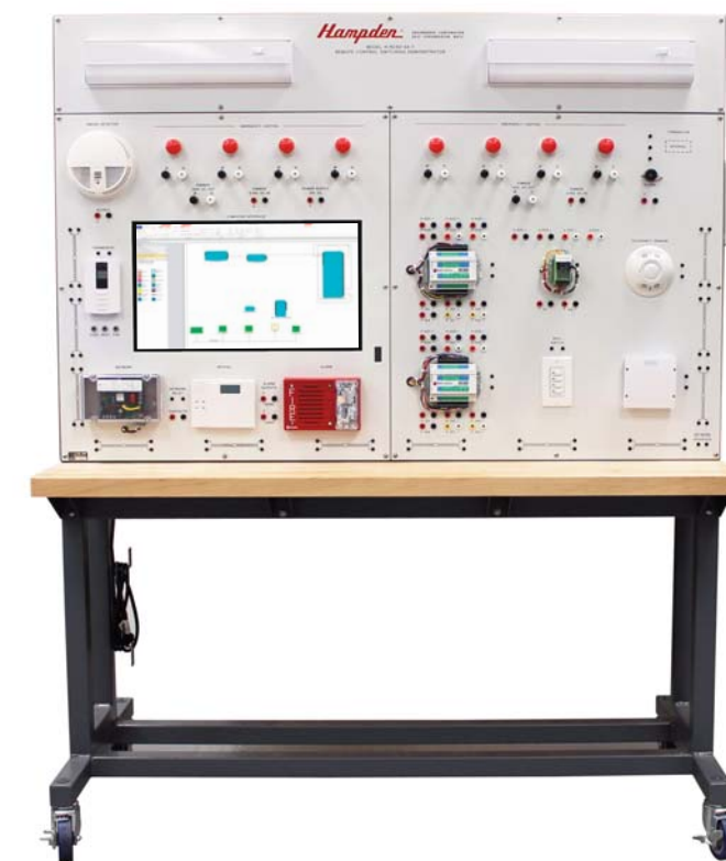
MODEL H-RCSD-3B Dimensions: 72"H x 60"W x 28"D Shipping Weight: 600 lbs

Simulate a residential/ commercial wiring sytem with LonWorks® Control System