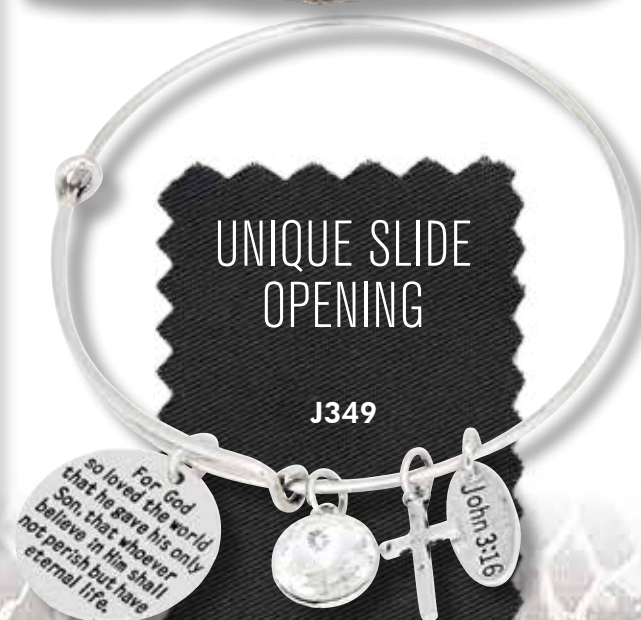
UNIQUE SLIDE OPENING