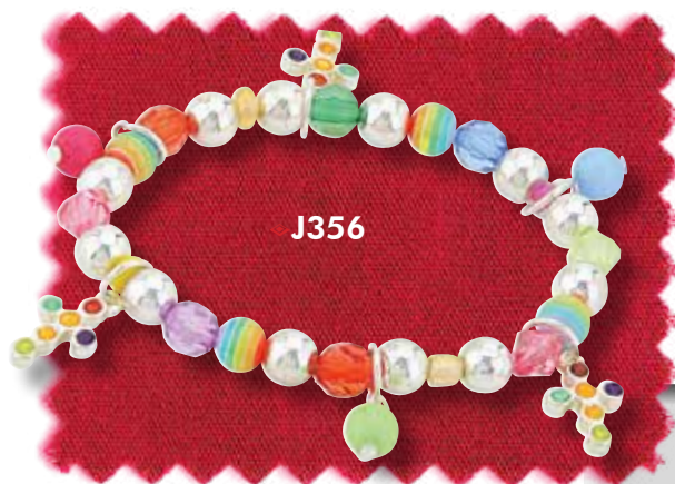
J356 MULTI-COLORED BRACELET |Brazetele| Little charmer. Stretch bracelet features cross charms and beads. One size fits most youth. $15.00