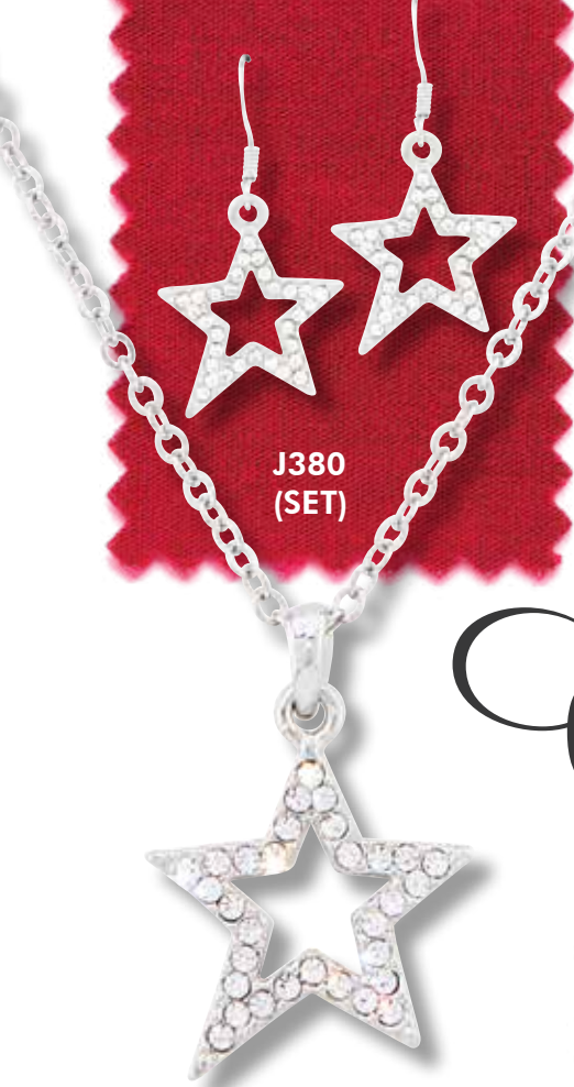
J380 WISHING STAR NECKLACE & EARRING SET |Collar y Pendientes| You are a star. Cut crystals outline star shape. 16" Chain and 3" extender with lobster clasp and 1" L earrings on French wires. $19.50