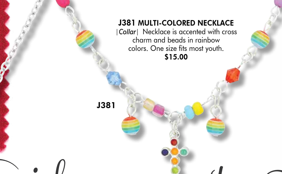
J381 MULTI-COLORED NECKLACE |Collar| Necklace is accented with cross charm and beads in rainbow colors. One size fits most youth. $15.00