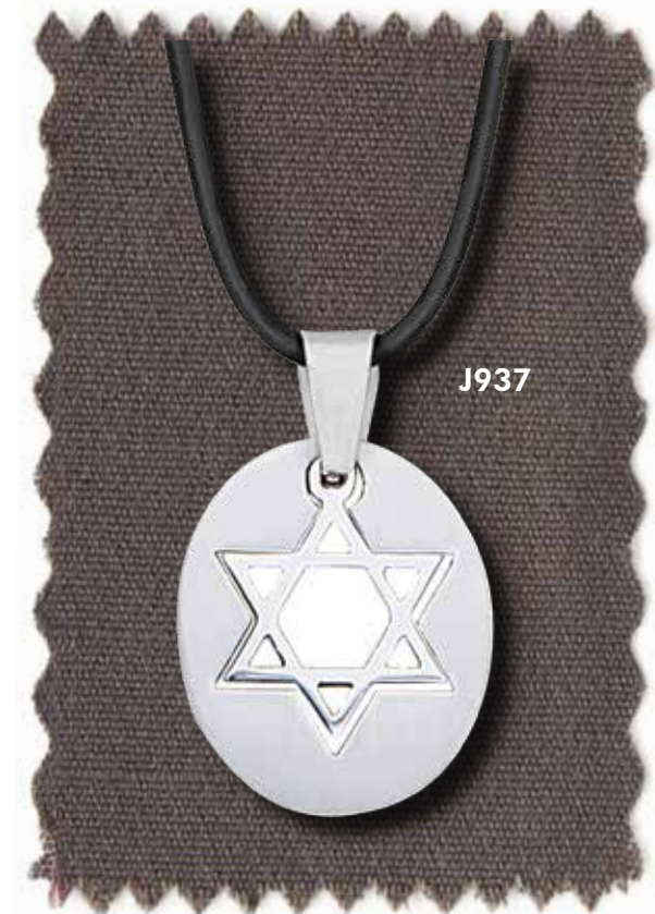
J937 STAR OF DAVID NECKLACE |Collar| Show of faith. Beautiful stainless steel 3-D necklace with laser cut out star inset. Pendant is 1-1/2" L, Necklace is 20-1/2" L. $19.50