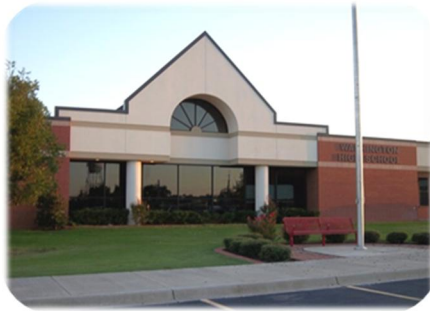
Washington High School—Washington, Oklahoma