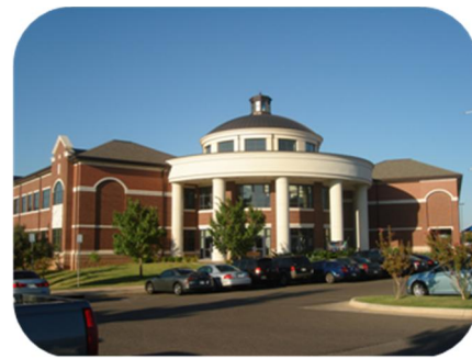
University of Central Oklahoma – Wellness Center