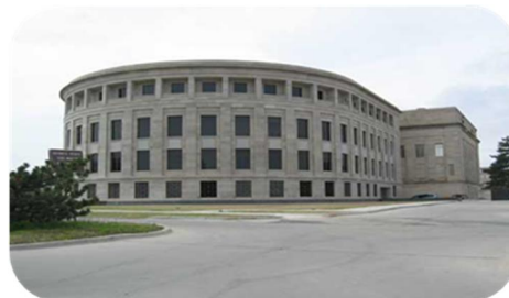
Oklahoma Supreme Court Building – Oklahoma City