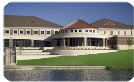
Moore-Norman Technology Center – South Penn Campus