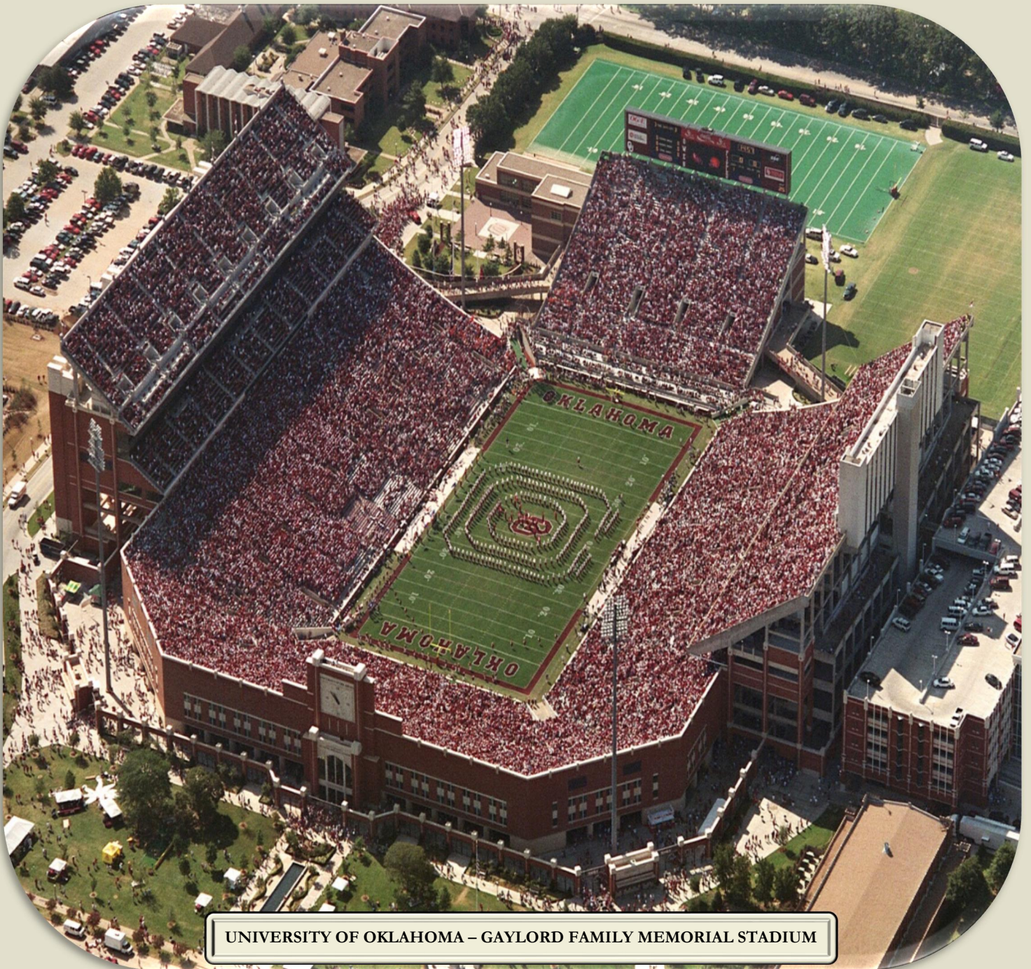
UNIVERSITY OF OKLAHOMA – GAYLORD FAMILY MEMORIAL STADIUM

“Serving Oklahoma’s public finance needs since 1968”