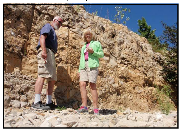
Checking out the Menard's excavation.

As we were leaving we saw that excavation had taken place when the building and parking lot were built, not long ago. So we rode the bike to the ledge and parked. It didn't take us long to see a layer of beautiful banded chert nodules in the wall about five feet above the parking lot level. We walked along the seam of what looked very much like pudding stone with circular to elliptical pieces of chert broken off at