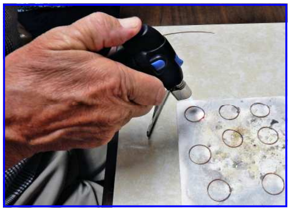
Soldering the rings