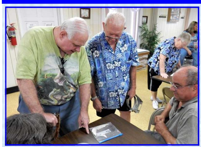
Identifying a deer jaw bone.