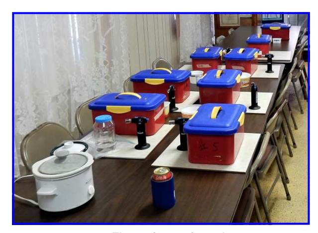
The equipment is ready