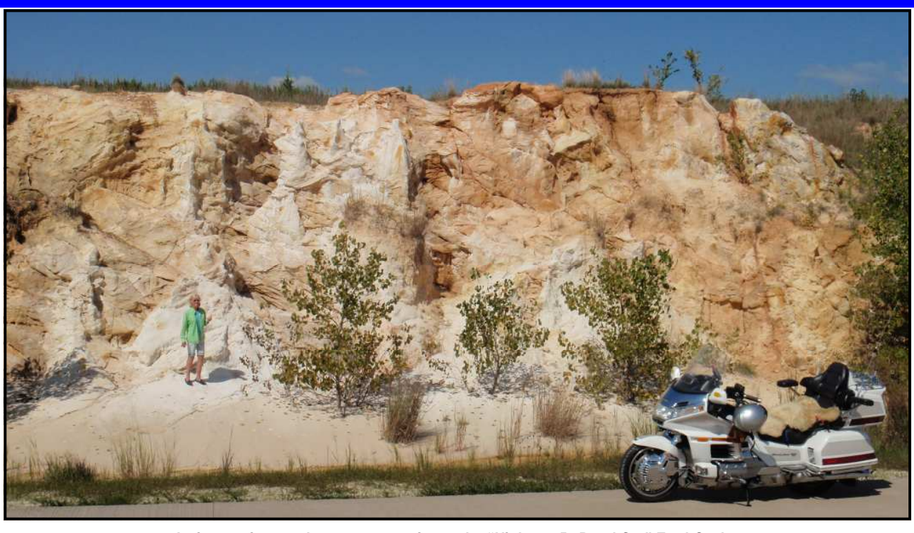
An interesting sandstone outcropping at the "Highway 50 Road Cut" EarthCache.