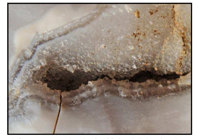
A tiny quartz crystal pocket (vug) in banded chert found at Menard's

The next day we went to a Runge Nature Center in Jefferson City, Missouri. Our mission was to locate an EarthCache named "Sherman's Rock", answer questions about the physical characteristics of the rock and surrounding vegetation, to prove that we actually found the EarthCache. We walked on a well maintained path that followed along beside a half dried up creek until we reached the big boulder on the side of the trail. Sher-