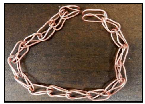
Next month we will finish the bracelets.

Now for the fun part, the class is over for this month and they will not finish until the September class. Guess what, I won't see it then either. It's time for me to take a cruise. I hope someone will take some good pictures. You know I will be thinking about that class the entire time that I am on board the ship.