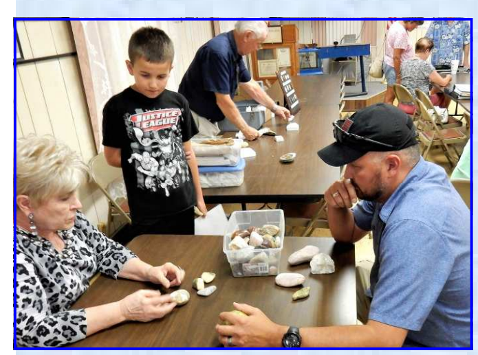
Identifying a deer jaw bone.