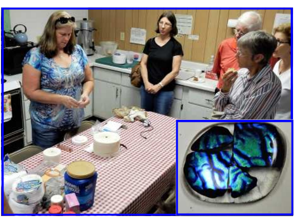
Microwave kiln demo and fused glass from the kiln.