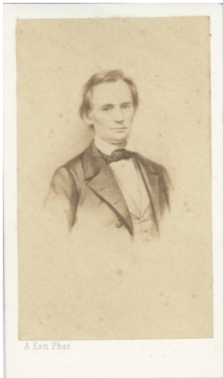
Abraham Lincoln (1809-1865)

Polk’s troubles from his Democrats are now matched by an increasingly vocal Whig opposition, with its 116-112 majority in the House.