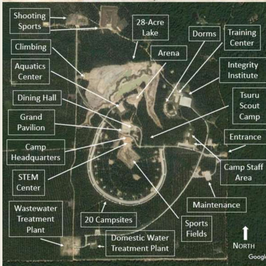
Aerial View of Roads and Building Pads