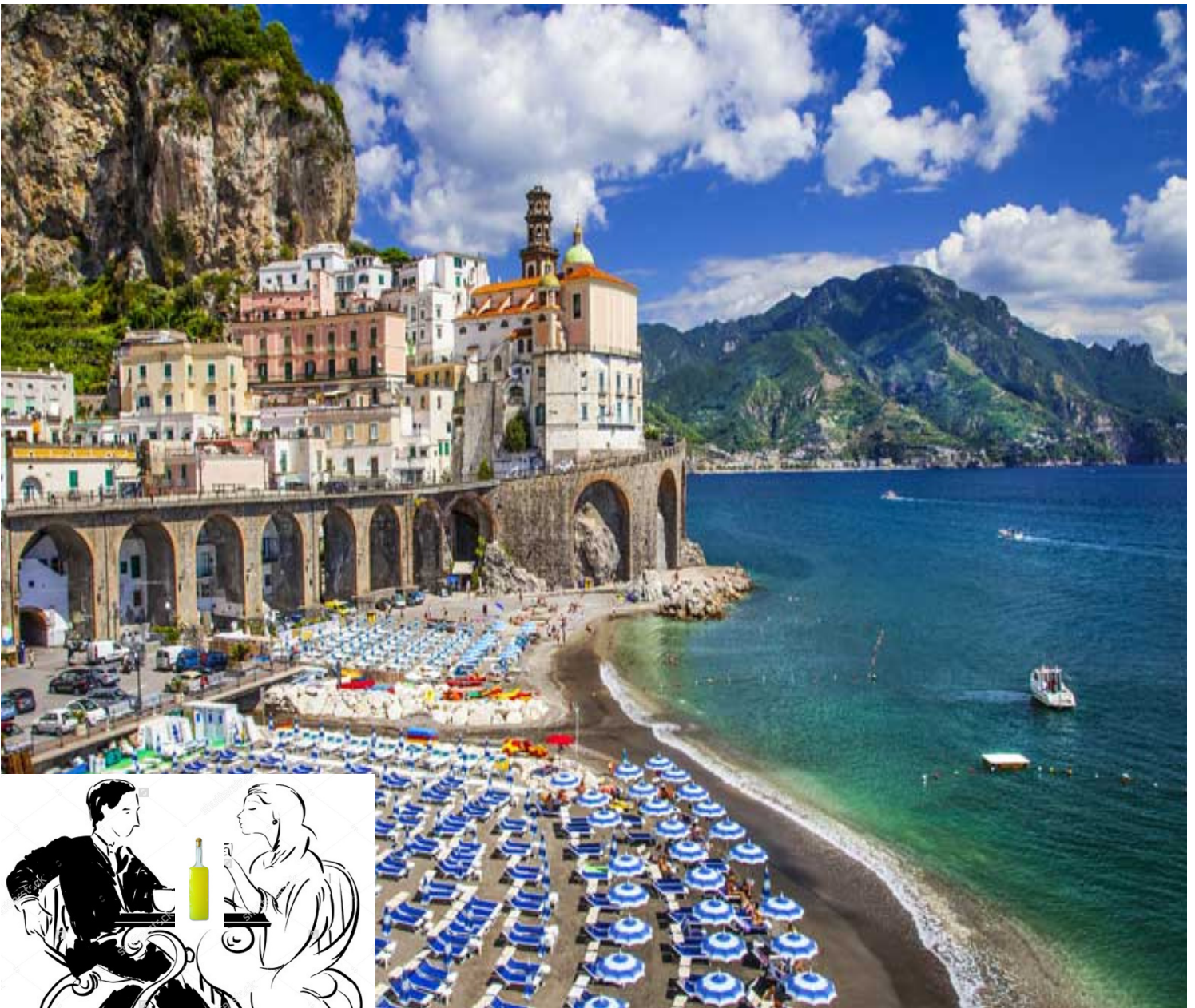
"L'arte di fare niente"

Your tour director will give you a brief orientation of the village before setting you free to enjoy its wonder. Later we will continue our journey to visit Ravello, one of the highest points on the Amalfi Coast with spectacular views of the turquoise Mediterranean sea below. We will visit Villa Rufolo, 13th Century villa with its wondrous gardens and magnificent views of the coastline below. Take some time to relax and people watch in one of the many outdoor cafes or bars sipping some ice cold Limoncello. See "L'arte di fare niente" on page 9 for instructions on some Italian Style Relaxation . Supper will be on your own. Overnight in Sorrento