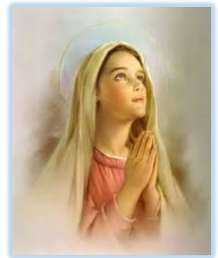
Feast Day: September 8