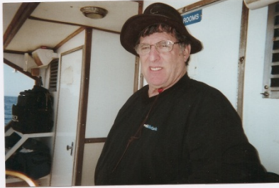
THESE RESTROOMS ARE CLEAN

This email was sent by Turner's Rod and Reel Club, P.O. Box 1988, Glendora, CA 91740.