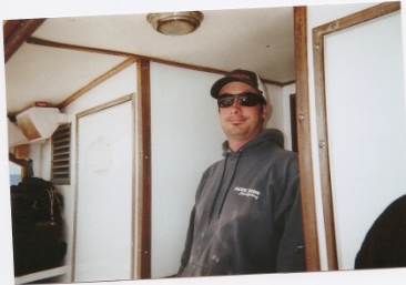
ANOTHER GOOD DAY