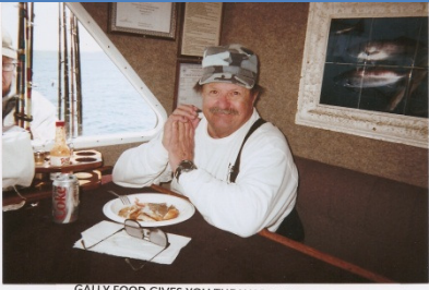
GALLY FOOD GIVES YOU THE WARM AND FUZZY FEELING