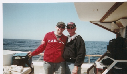
FATHER AND SON TEAM