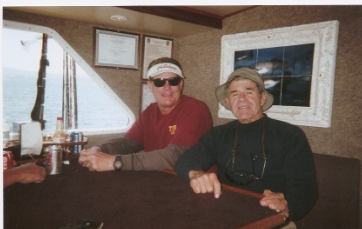
WE ARE RESTING OUR FEET RIGHT NOW