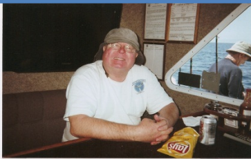
IT'S NICE TO BE ON THE OCEAN AGAIN