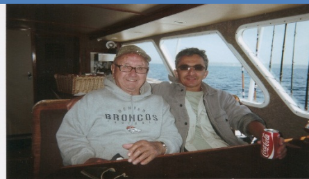
THE WEATHER AND FISHING WAS GOOD