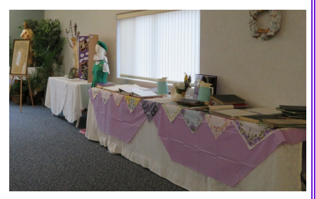
Treasured keepsakes—history of Ct. St. Cecelia