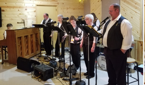
Friday Night Supper - - - entertained by "Joyful Noise"