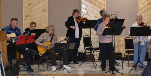
"Silver Strings" Saturday Banquet