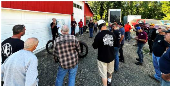
The daily rider's briefing.