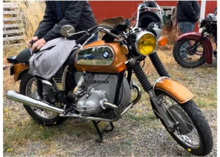
Kris Thomson's 1973 BMW R75/5