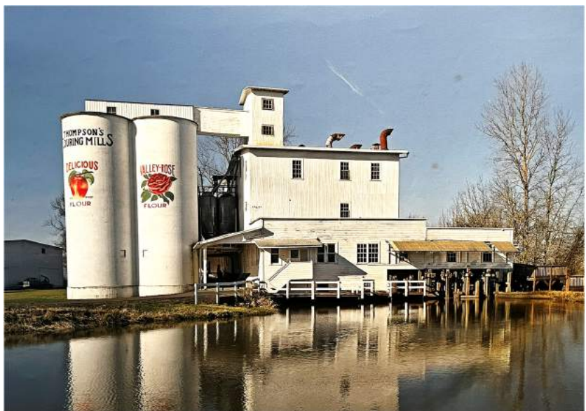
Thompson's Mill State Heritage Site