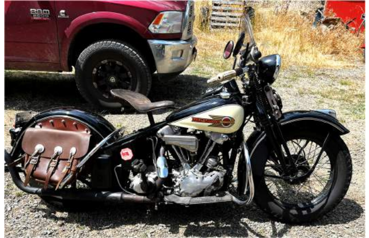
1939 HD Model EL owned by Art May of Hawaii