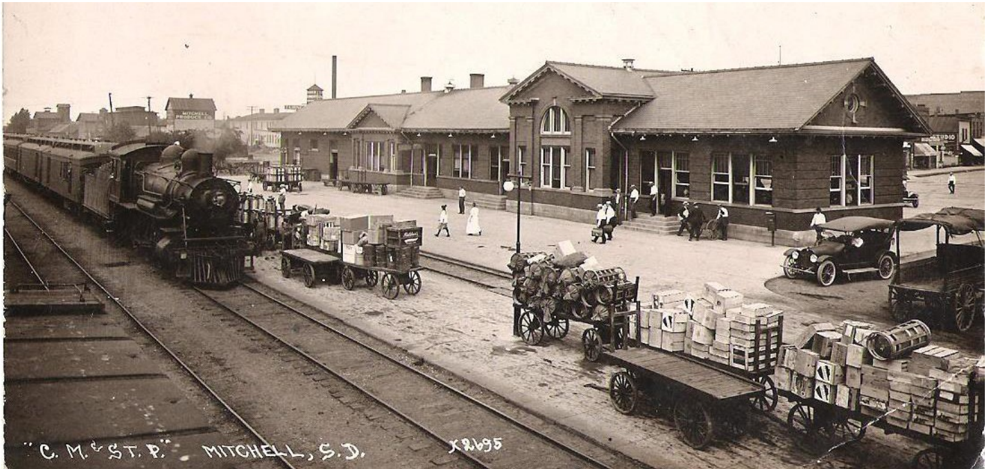
At lower left is inscribed “C.M. & St. P., Mitchell, S.D.” on this photo of the Chicago, Milwaukee, and St. Paul Railroad depot in Mitchell where the Interstate Café was located . The view is from the southeast. The photographer and date are unknown.