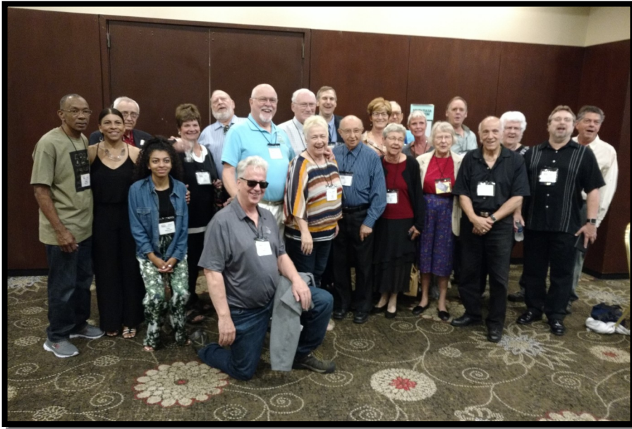
MHHHC Members at 2017 SPAH Convention in Tulsa, OK