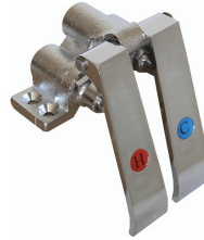
Hot & Cold