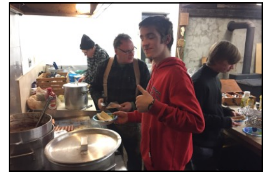
Friday January 5 - Sunday January 7, 2018 By Nathan Schallack