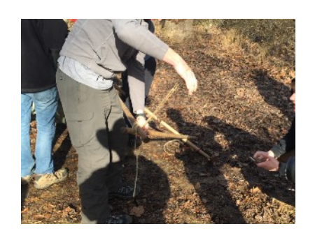
Click here for more pictures and videos from the Klondike Derby.