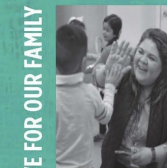
LOVE FOR OUR FAMILY