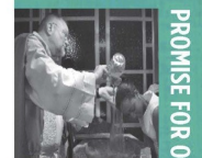
PROMISE FOR OUR FUTURE