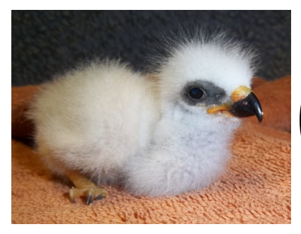
Another successful year, thanks to you! Enjoy a few of the Faces of 2012 that your contributions helped save.