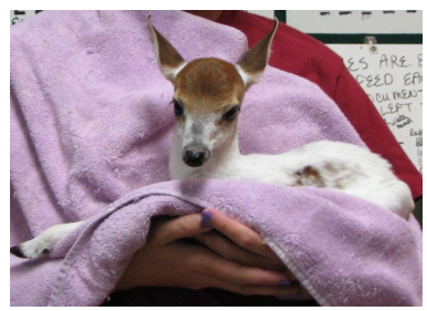
Because she was born on approximately July 4th, she became known as "Liberty".