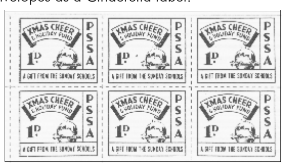
Above: Is the 1939 "Xmas Cheer Holiday" Sheet. Below 1961's Christmas seals

In New Zealand, one organisation that worked for the benefit of children began in 1907 and was the Presbyterian Church of New Zealand, which formed the Presbyterian Social Services Association. One aim was the running of orphanages. In 1939 at Christmas time a special stamp booklet was issued, and sold by Sunday school children in New Zealand to help provide a happier Christmas and holiday period for children in Presbyterian Social Services homes. They weren't especially sold to put on Christmas mail but can occasionally be found on envelopes as a Cinderella label.