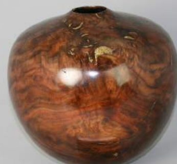
TAW INSTANT GALLERY Jerry Prosite