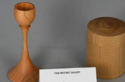
TAW INSTANT GALLERY Pete Wiens