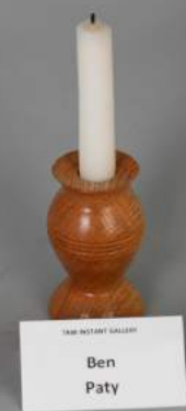
TAW INSTANT GALLERY Ben Paty