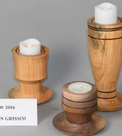
TAW 2016 KEN GRISSIM