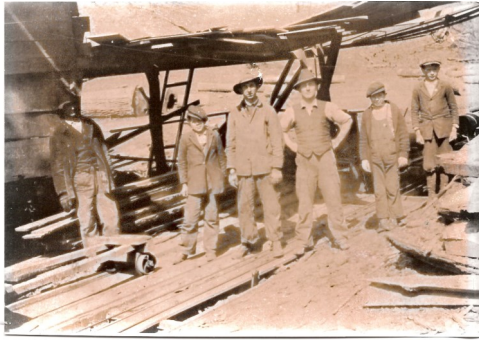
Almendinger Family 1917