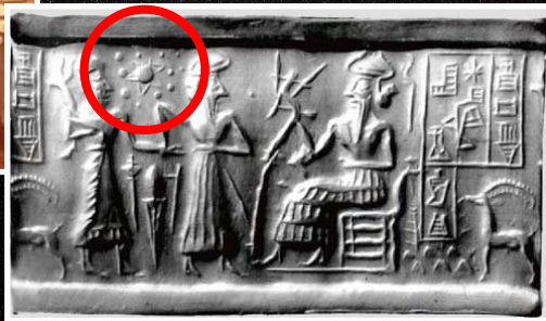
VA-243 Sumerian Scroll made famous by Zecharia Sitchin entitled the Granting of the Plow by the Anunnaki to their created humans on Earth.

Ancient depiction of Nemesis, as the Winged Disc with horns. It is different from Nibiru. Nibiru is one of the 7 planets believed to orbit the 'Death Star', Nemesis or the Black Sun.