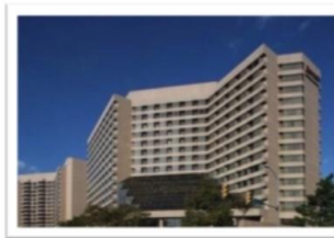
Crystal Gateway Marriott

Crystal Gateway Marriott 1700 Jefferson Davis Highway Arlington, VA 22202