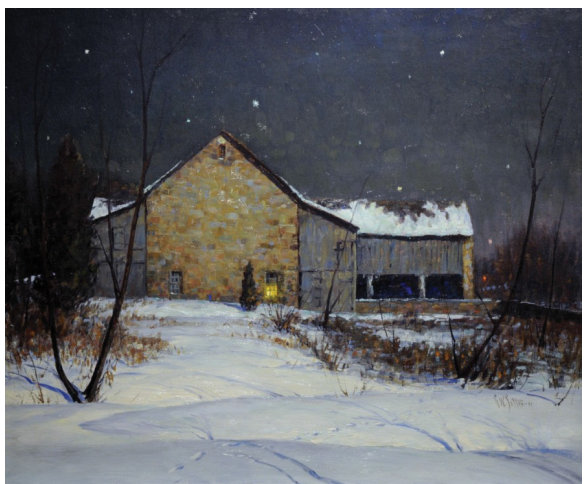
Available at the Gallery: George Sotter, Sotter's Barn, O/B, 22" x 26"