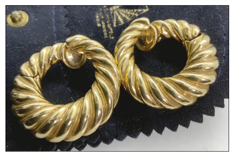
A pair of vintage Van Cleef & Arpels 18K gold rope hoop earrings ($1/4,000) has the Van Cleef & Arpels maker's and workshop hallmarks.