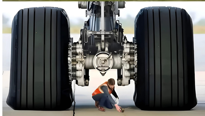
Top: C-5M Super Galaxy taking off. Bottom: Wheels; want to change a flat?

With dimensions that defy imagination, the C-5M Super Galaxy stands as a testament to human ingenuity and military dominance. When you see this flying behemoth, your looking at one of the largest military aircraft in the world - a true titan in the skies.