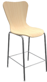
CL-7 A : 18" C : 24" E : 17"