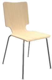
CM-4 A : 16" C : 18" E : 17"