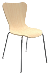
CL-4 A : 18" C : 18" E : 17"