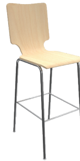
CM-8 A : 16" C : 30" E : 17"