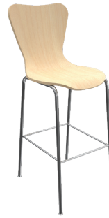
CL-8 A : 18" C : 30" E : 17"