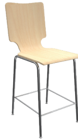
CM-7 A : 16" C : 24" E : 17"