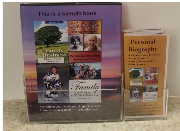
Picture of a stand on location