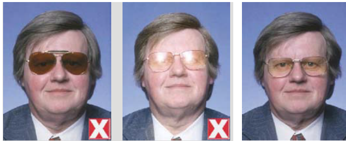
dark tinted lenses