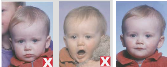
shows another person