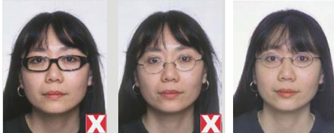
frames too heavy