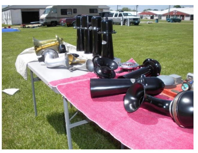
There were horns aplenty at this vendor's table